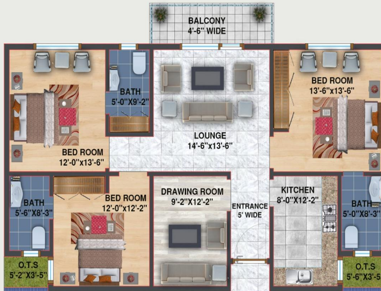
TYPE-A 3-BEDS APARTMENT (1306.25 SFT)

Kashmir Avenue (FGEHA), Mauve Area, G-13, Islamabad