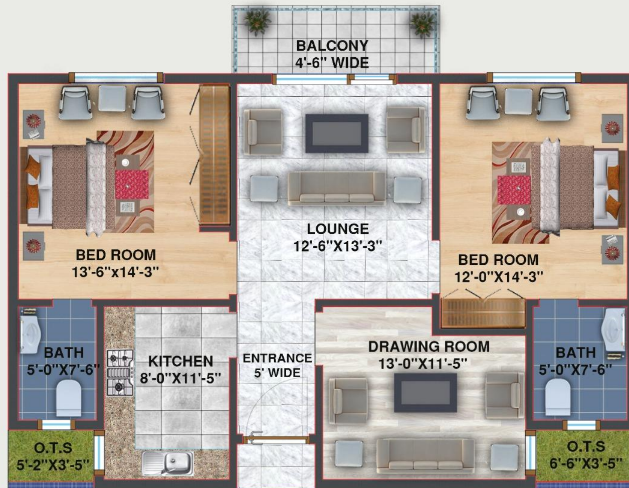
TYPE-B 2-BEDS APARTMENT (1100 SFT)